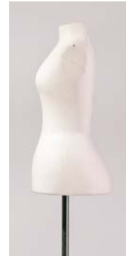
RET04 | BELLE EPOQUE