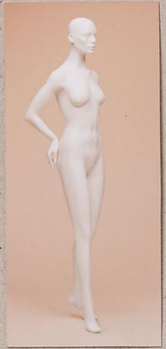
FAS02 HANDS ON BUM