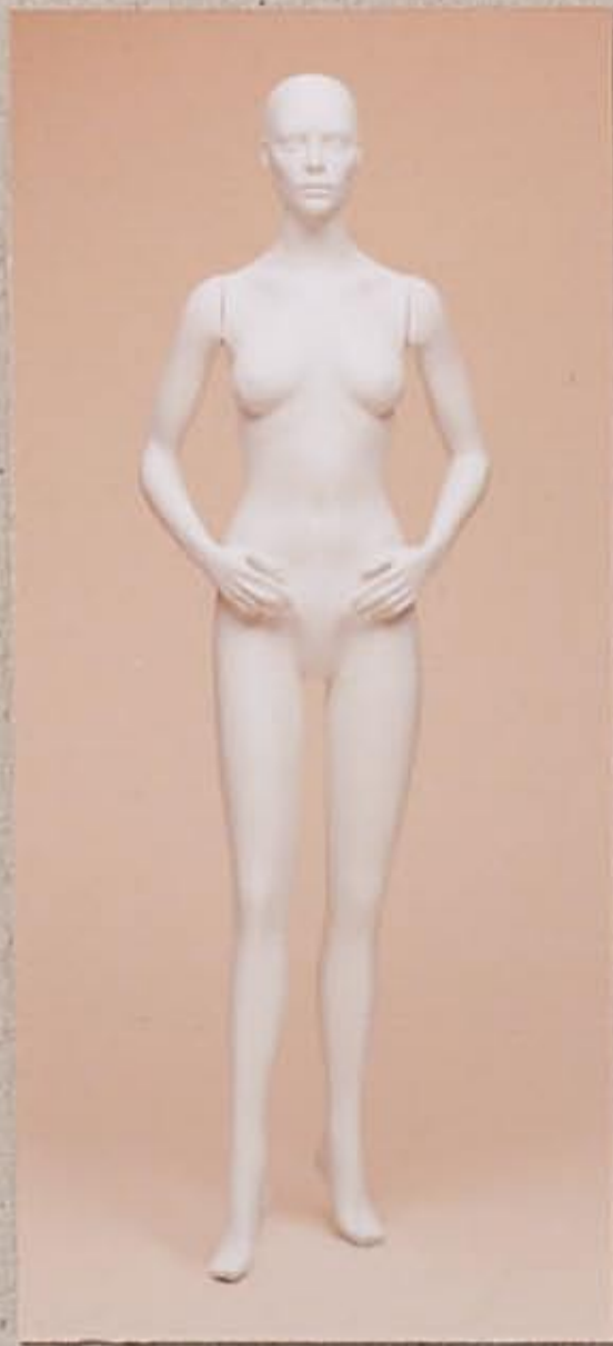
FAS02 HANDS IN POCKET