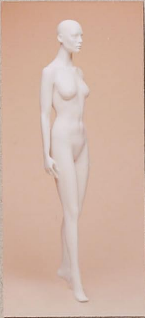
FAS02 STRAIGHT ARMS