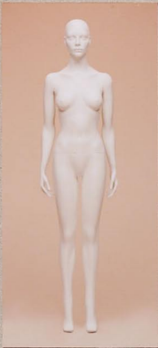
FAS01 STRAIGHT ARMS