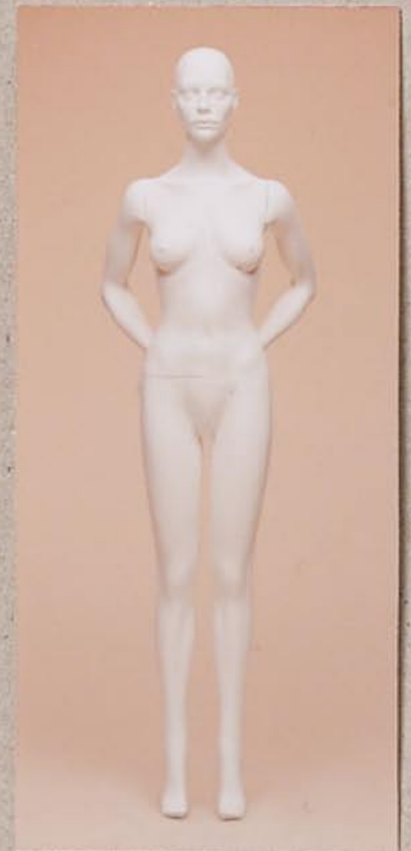
FAS01 HANDS ON BUM