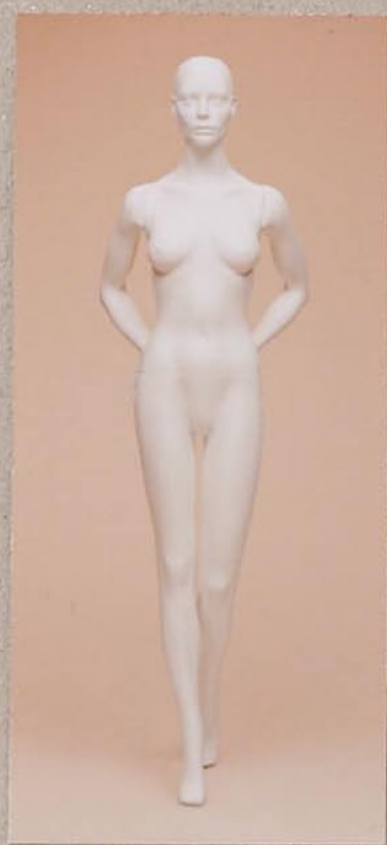
FAS03 HANDS ON BUM