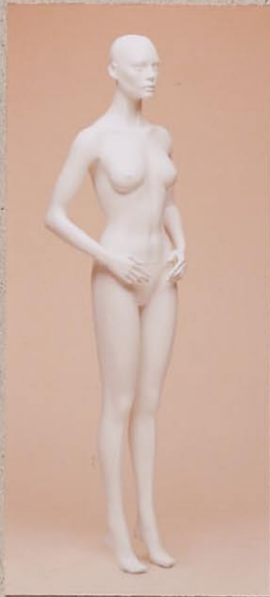
FAS01 HANDS IN POCKET