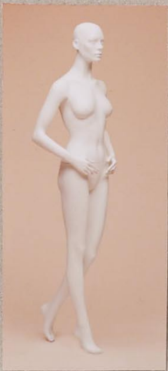
FAS03 HANDS IN POCKET