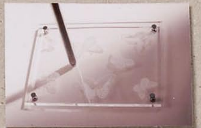
BASE FAS09 →